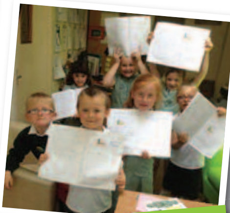
Year 2 Writing Stars