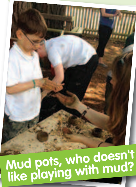
Mud pots, who doesn't like playing with mud?