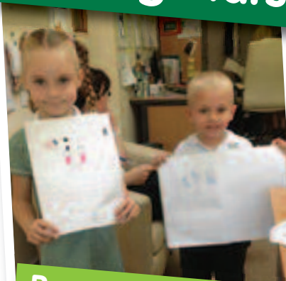
Reception Writing Stars