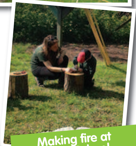
Making fire at Forest School