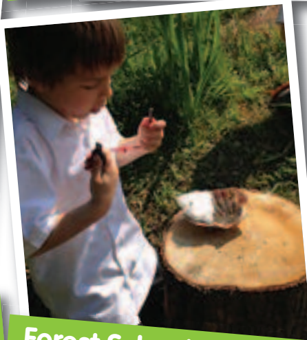
Forest School in Action