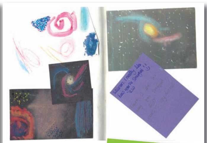
By Lauren Hunt