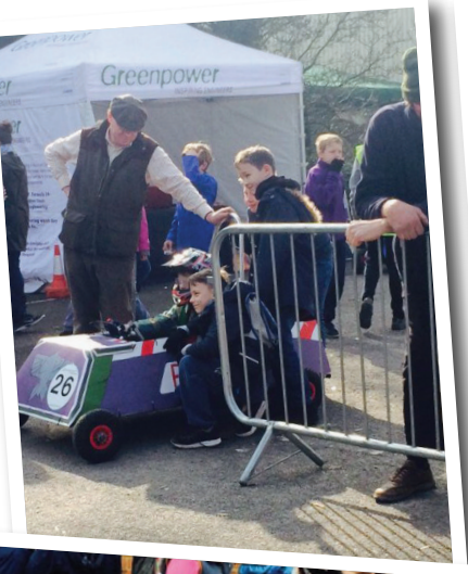
Year 5 took a trip over to Plumpton Agricultural College to race the go kart they had built and prepared over the past ten weeks.