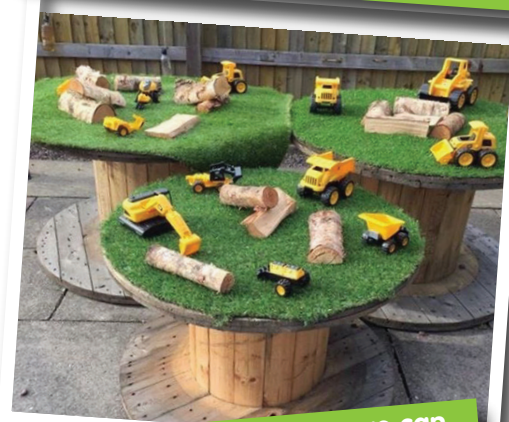
Lots of wonderful things we can create with cable reels.