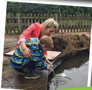
Time to free the tadpole. Back to its natural habitat.