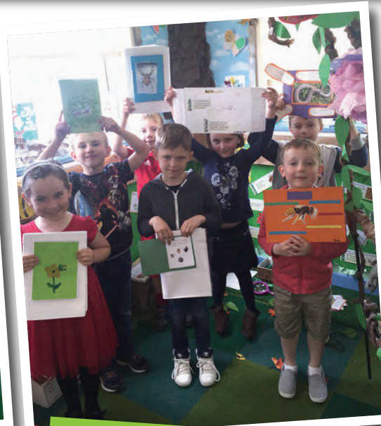
Year 1 Homework