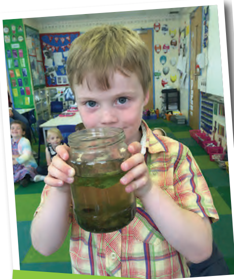
Science week in year 1