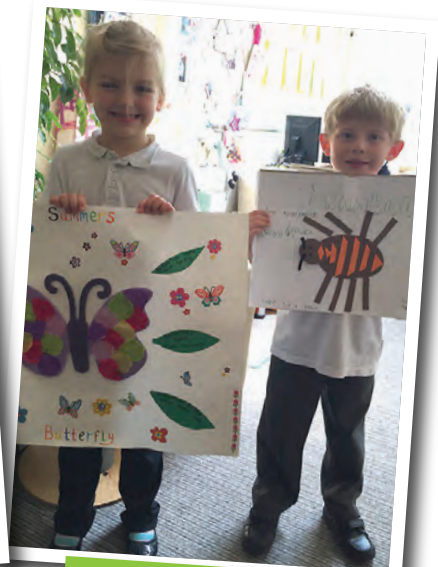
Fabulous Year 1 homework!