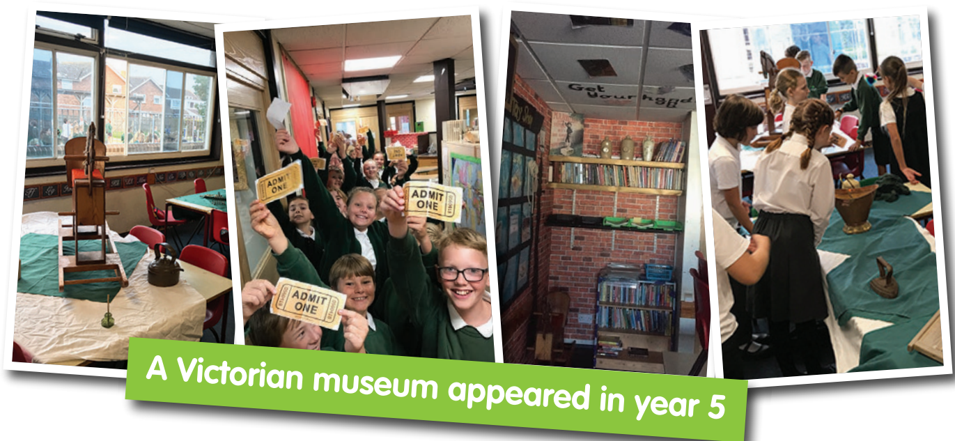
A Victorian museum appeared in year 5