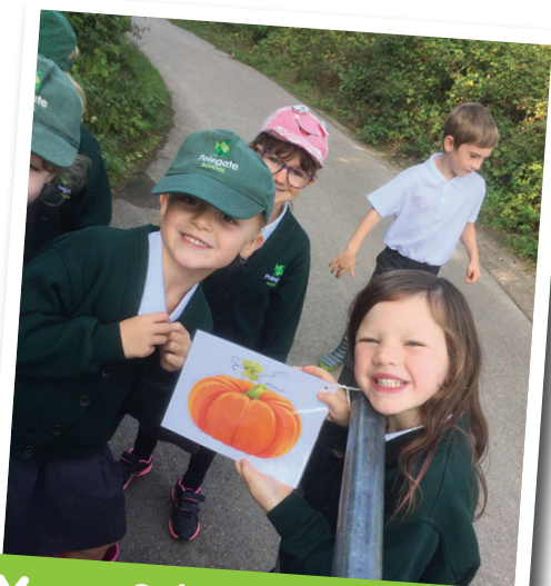
Year 2 having fun on their stunning start!