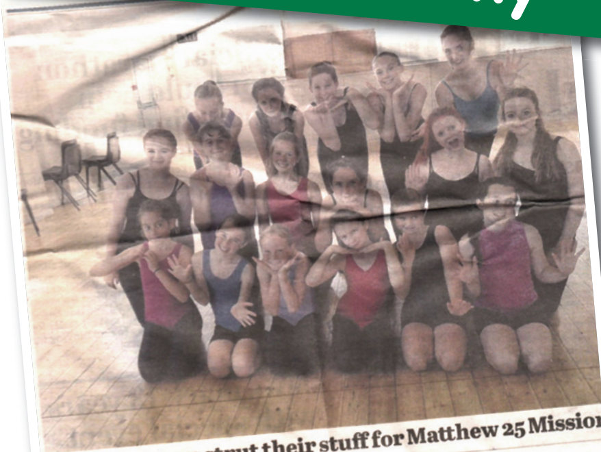
Youngsters strut their stuff for Matthew 25 Mission

Youngsters from the Willingdon School of Dancing performed at Christ Church on July 13 to support Matthew 25 Mission's open day.