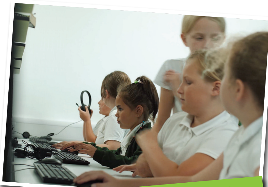
Pupils enjoying our new Information Hub