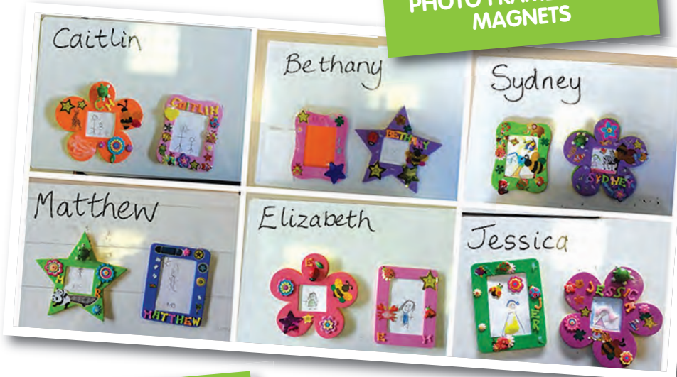
PHOTO FRAME FRIDGE MAGNETS

If you think you might be interested in running a club feel free to pop in and have a chat with us. We are happy to offer any support and advice to get you started.