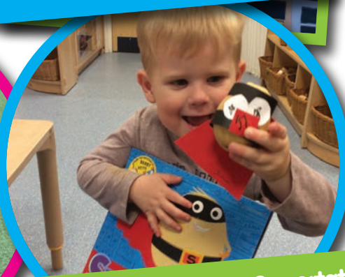
We made our own Supertato!