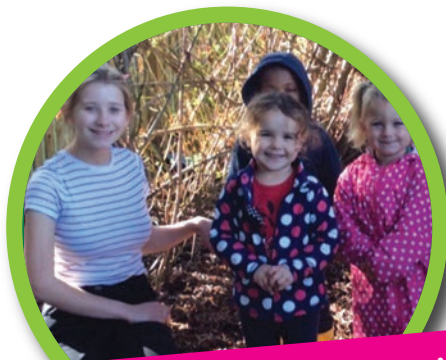
Autumn scavenger hunt