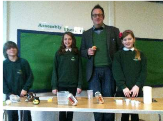
Our launch assembly with our scientists demonstrating how Science can appear to be magic! Take a look at the cans balancing!

The world we live in today would no doubt be a different place if it weren't for the amazing discoveries produced by this list of famous scientists. Their ideas, research, experiments, publications and determination are an inspiration to those that follow in their footsteps. Covering a broad range of scientific fields such as biology, physics, astronomy and chemistry, these men and women have pushed the world of science forward, allowing the human race to answer seemingly impossible questions while at the same time opening the door to new fields of research and discovery.