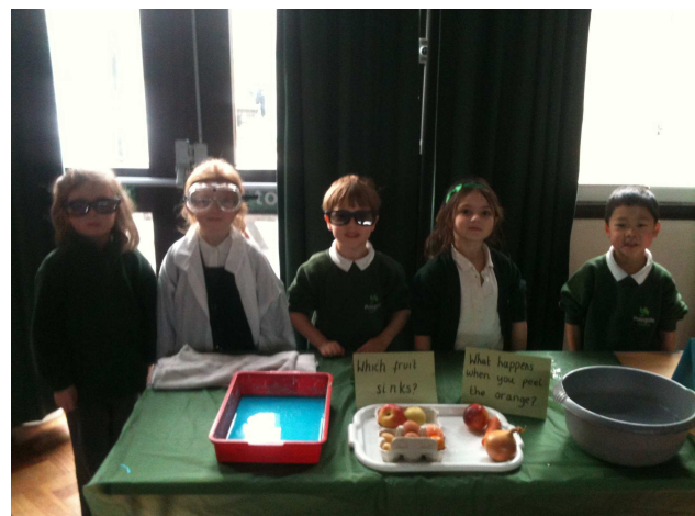
Just some of our Scientists! Look out in the next newsletter for more about our wonderful week.