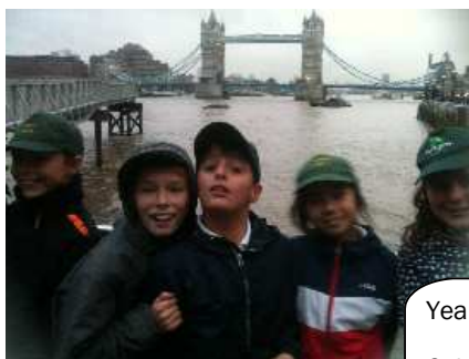
Year 6 trip to London.

If you have returned a slip requesting clubs for your child you will receive a letter this week notifying you if they have a place or not.