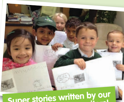
Super stories written by our budding reception writers!