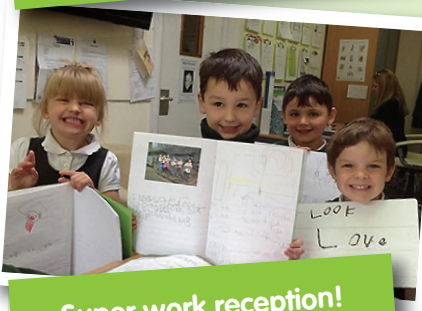
Super work reception!