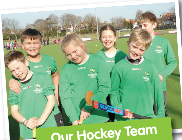
Our Hockey Team