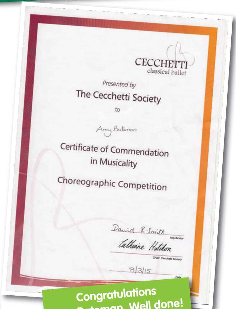
Congratulations Amy Bateman. Well done!