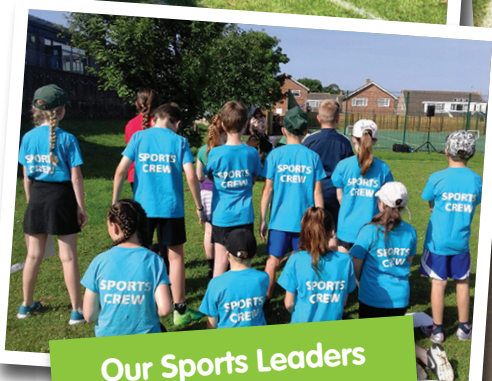
Our Sports Leaders