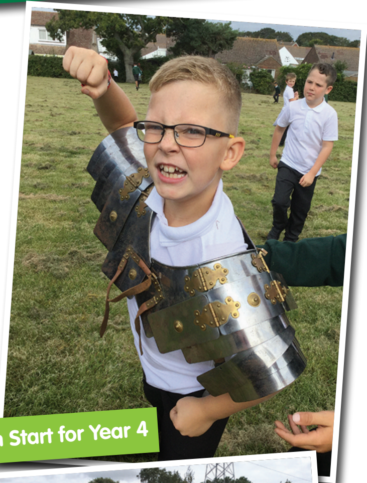
Great Fun Start for Year 4

They made predictions about what they were, who used them and how old they were and then researched further to find out.